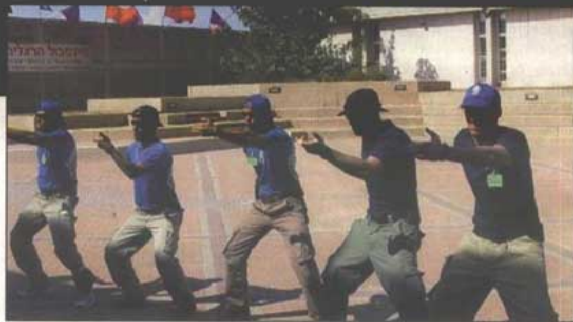
ISA trainees practice Israeli method of chambering a round in the process of drawing the pistol. Though highly contested for numerous reasons, this method, like any other discipline, is highly effective in the hands of a skilled practitioner and offers its own unique advantages.

given a new "girl" name and it becomes their tag for the duration of the course activities. In a very short time, the team even develops a sense of pride in their female named group. May, our team translator, becomes quite fond of saying, "The Ladies always win."